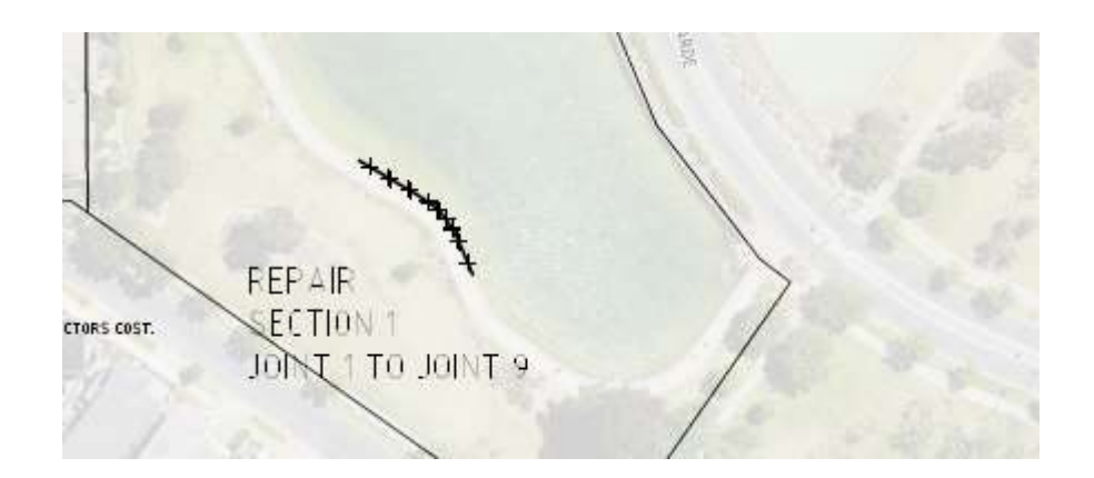
The tender process closes in two weeks, following which we will be able to ascertain contract availability and methodology and confirm a schedule for the works.