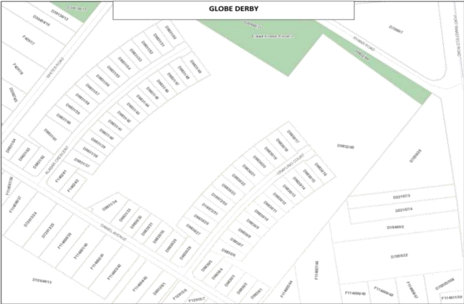
Item GB3 - Attachment 1 - Globe Derby Allotment Plan