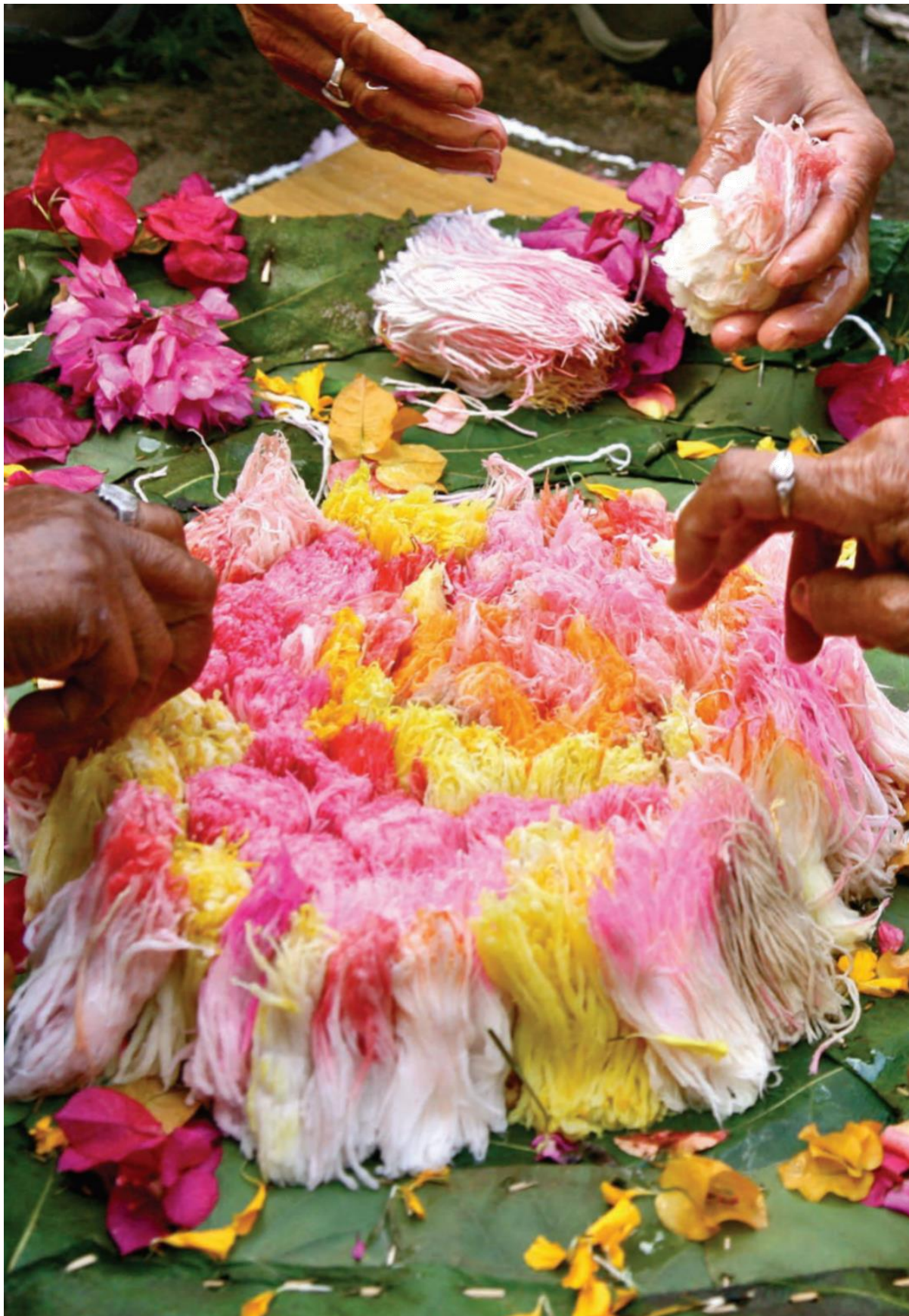
Item ISPS1 - Attachment 1 - Intercultural Strategic Plan 2017-2027