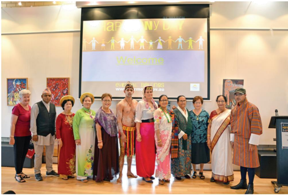
City of Salisbury

It notes that the framework for the provision of Council support is based on inclusion, citizenship, participation and infrastructure.