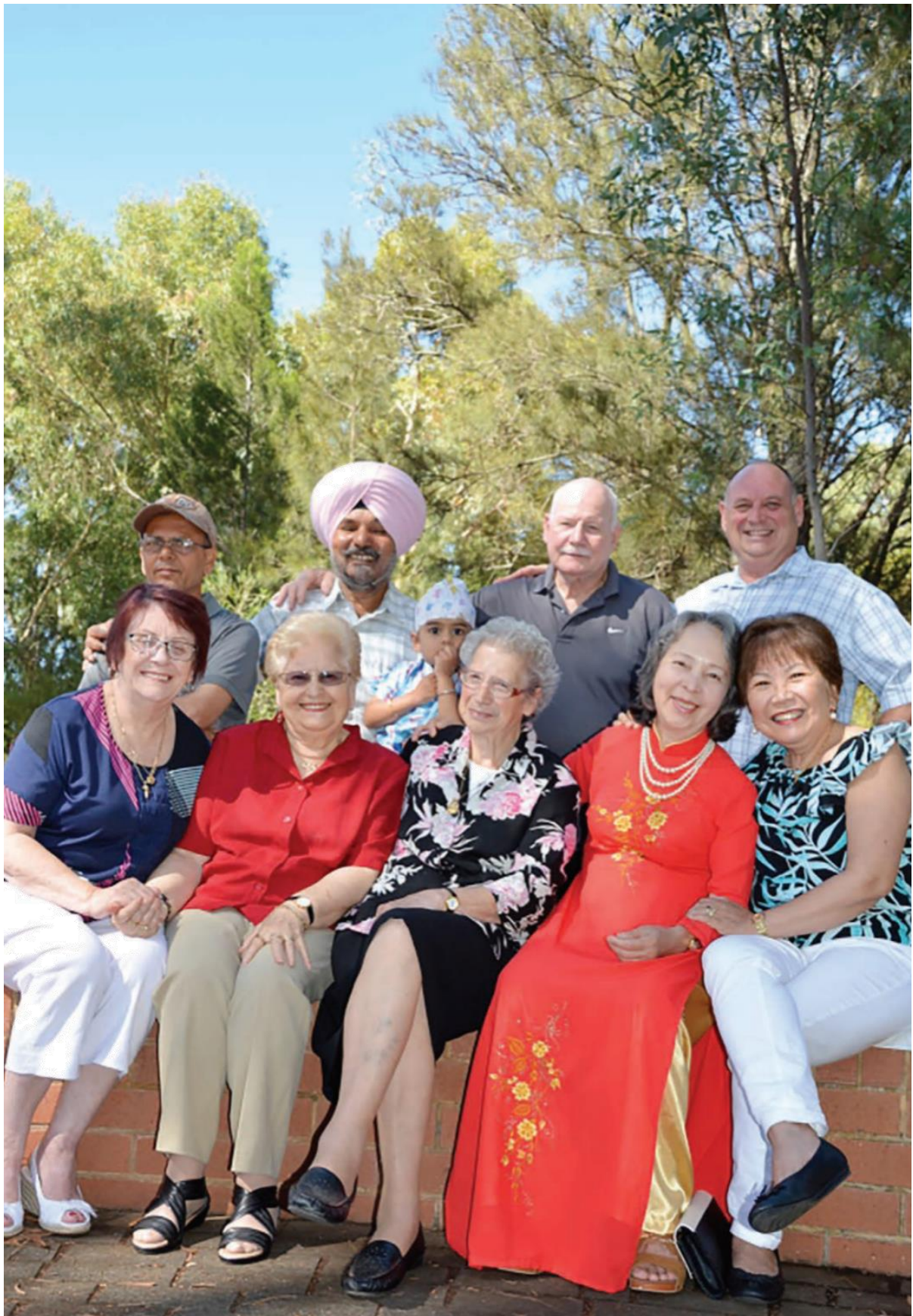
Item ISPS1 - Attachment 1 - Intercultural Strategic Plan 2017-2027