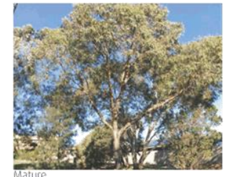
Eucalyptus albopurpurea Purple-flowered Gum