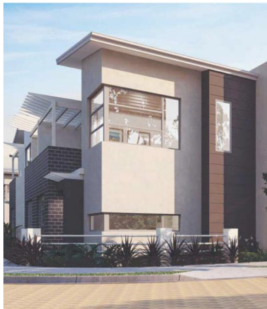
QUALITY LIVING: Salisbury Council and Rivergum Homes' Jewel Living project won the affordable development category at a national industry awards last night.