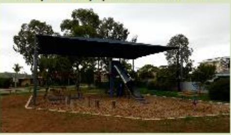
Davey Oval Play Space Shade Structure