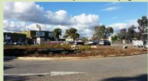
Resource Recovery Park Landscaping