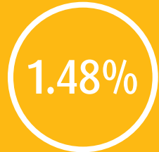
Operating Surplus Ratio