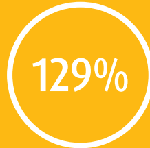
Asset Sustainability Ratio