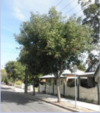
Chinese Pistachio Pistacia chinensis

A deciduous tree, up to 10m in height, with a rounded canopy. It has fern-like foliage that turns from bright green to crimson red in autumn. It is tolerant of a range of soil conditions.