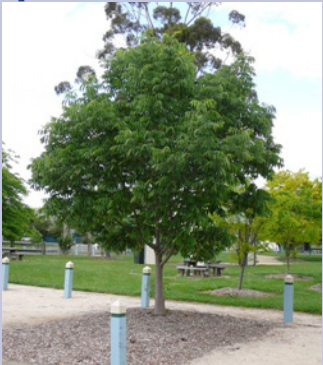
Green Ash Fraxinus pennsylvanica 'Urbanite'

A deciduous tree, up to 10m in height, with a dense canopy. It has dull green coloured foliage that turns bronze in autumn. This tree is tolerant of a range of soil and climatic conditions and is recommended for medium verges.