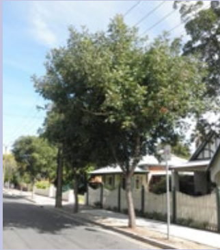
Chinese Pistachio Pistacia chinensis

A deciduous tree, up to 10m in height, with a rounded canopy. It has fern-like foilage that turns from bright green to crimson red in autumn. It is tolerant of a range of soil conditions. This tree is recommended for small verges and under powerlines, and is SA Water approved. Local example: Talbot Street, Hilton.