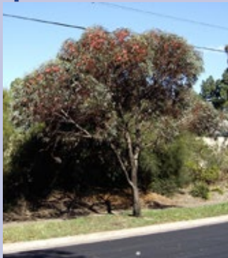
Coral Gum Eucalyptus torquata

An evergreen tree, up to 8m in height, with an open crown of grey-green foliage. It has a rough dark trunk and showy orange-pink flowers for most of the year. This tree is recommended for small verges and under powerlines, and it is SA Water approved. Local example: Salisbury Highway, Parafield Gardens.