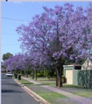
Jacaranda Jacaranda mimosifolia

A deciduous tree, up to 12m in height, with a spreading canopy. It has fern-like foliage and profuse purple flowers that appear in spring and summer. This tree is recommended for medium width verges and is SA Water approved. Local example: Goodall Crescent, Salisbury; Davis Street, Salisbury