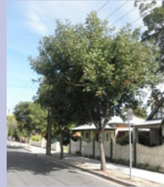
Chinese Pistachio Pistacia chinensis

A deciduous tree, up to 10m in height, with a rounded canopy. It has fern-like foilage that turns from bright green to crimson red in autumn. It is tolerant of a range of soil conditions. This tree is recommended for small verges and under powerlines, and is SA Water approved. Local example: Talbot Street, Hilton.