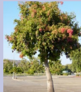
Kurrajong 'Bella Donna' Brachychiton populneus x acerifolius Belladonna

This is a small to medium sized shade tree 6m high, offering glossy green foliage and pretty clusters of salmon pink, bell-shaped flowers in Summer. Flowers are bird attracting.