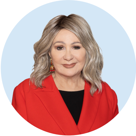
Mayor Gillian Aldridge OAM

I’m pleased to share Council’s plans for the year ahead in the City of Salisbury. To support continued investment in services and infrastructure while maintaining responsible financial management, Council has set a modest rate increase of 4.2% - equivalent to just $1.70 per week for the average ratepayer. Your rates help us build a progressive, sustainable and connected community. In 2025/26 we’re investing in Sport & Recreation, including the installation of bike pump tracks across the city and upgrading the playing surface at Manor Farm, Salisbury East.