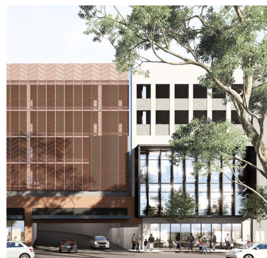
Images: Salisbury City Centre render - Site 1 and 2