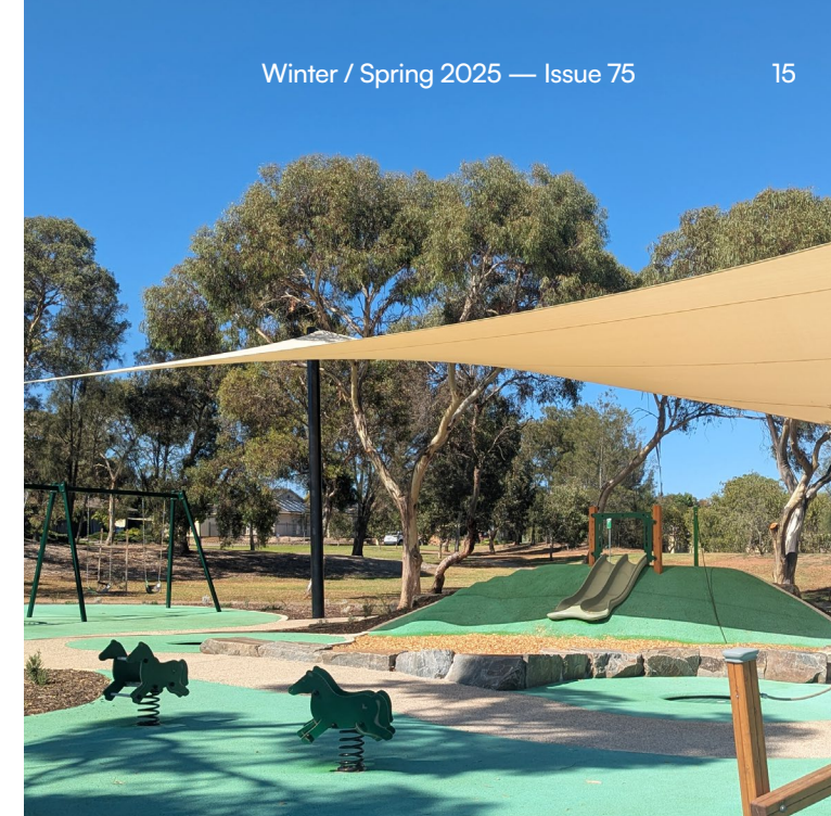
Image: Playground at St Albans Drive Reserve

These additions offer plenty of fun and adventure for children of all ages.