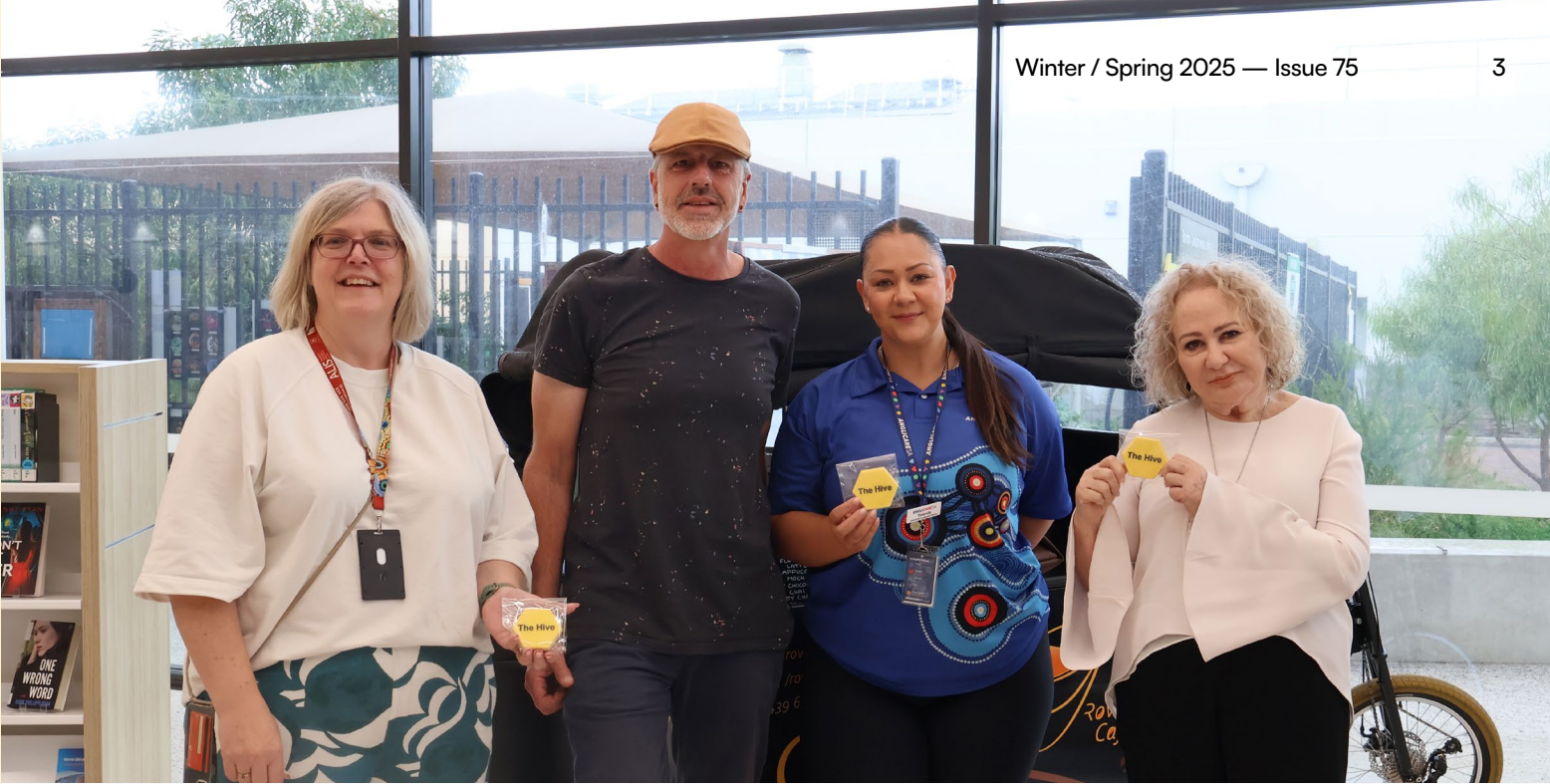
Image: The Hive Community Resource Hub launch

Send your story ideas to communications@salisbury.sa.gov.au