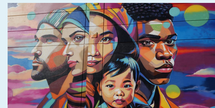
Images: Murals at Paralowie Village Shopping Centre created by artists Malicious Delicious (top) and Jimmy C (bottom)

Earlier this year, the City of Salisbury sought community input on a plan to shape the future of local art and culture. The Arts and Culture Development Plan is currently being drafted and will support festivals and events, live music, exhibitions, heritage preservation and arts programs.