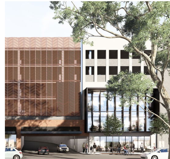
Images: Salisbury City Centre render - Site 1 and 2