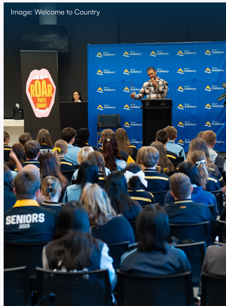
Image: Welcome to Country

Meanwhile, the 2025 ROAR Youth Summit, held during Youth Week at the Salisbury Community Hub, brought more than 150 local young people together for workshops, inspiring guest speaker presentations, and opportunities to shape future initiatives.