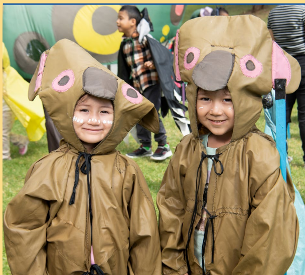
Image: Salisbury Community Fun Day at Pitman Park

6 December — Salisbury Community Christmas Carols Carisbrooke Park