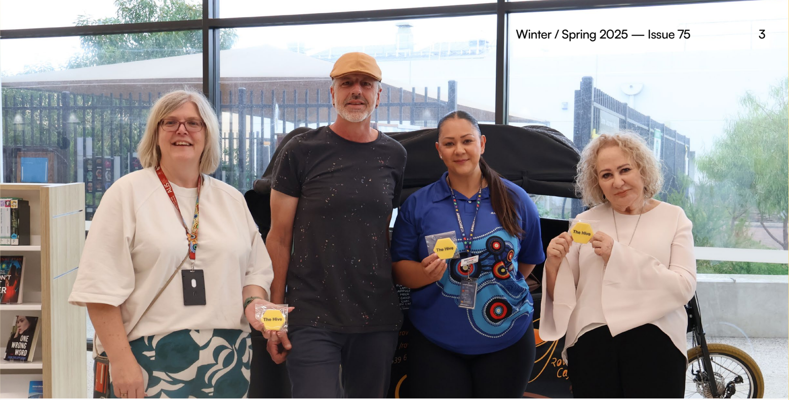
Image: The Hive Community Resource Hub launch