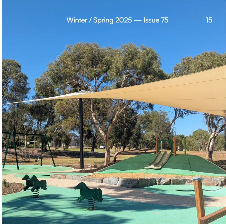
Image: Playground at St Albans Drive Reserve

These additions offer plenty of fun and adventure for children of all ages.