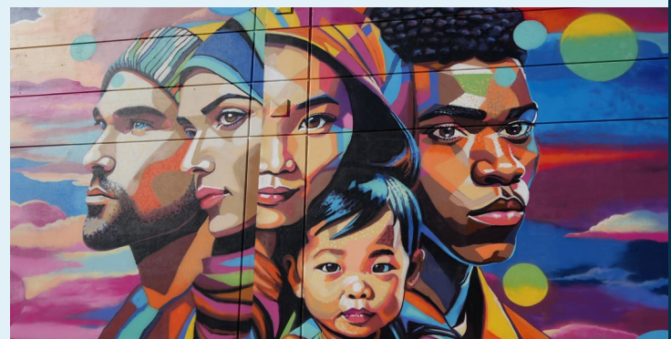
Images: Murals at Paralowie Village Shopping Centre created by artists Malicious Delicious (top) and Jimmy C (bottom)

Earlier this year, the City of Salisbury sought community input on a plan to shape the future of local art and culture. The Arts and Culture Development Plan is currently being drafted and will support festivals and events, live music, exhibitions, heritage preservation and arts programs.