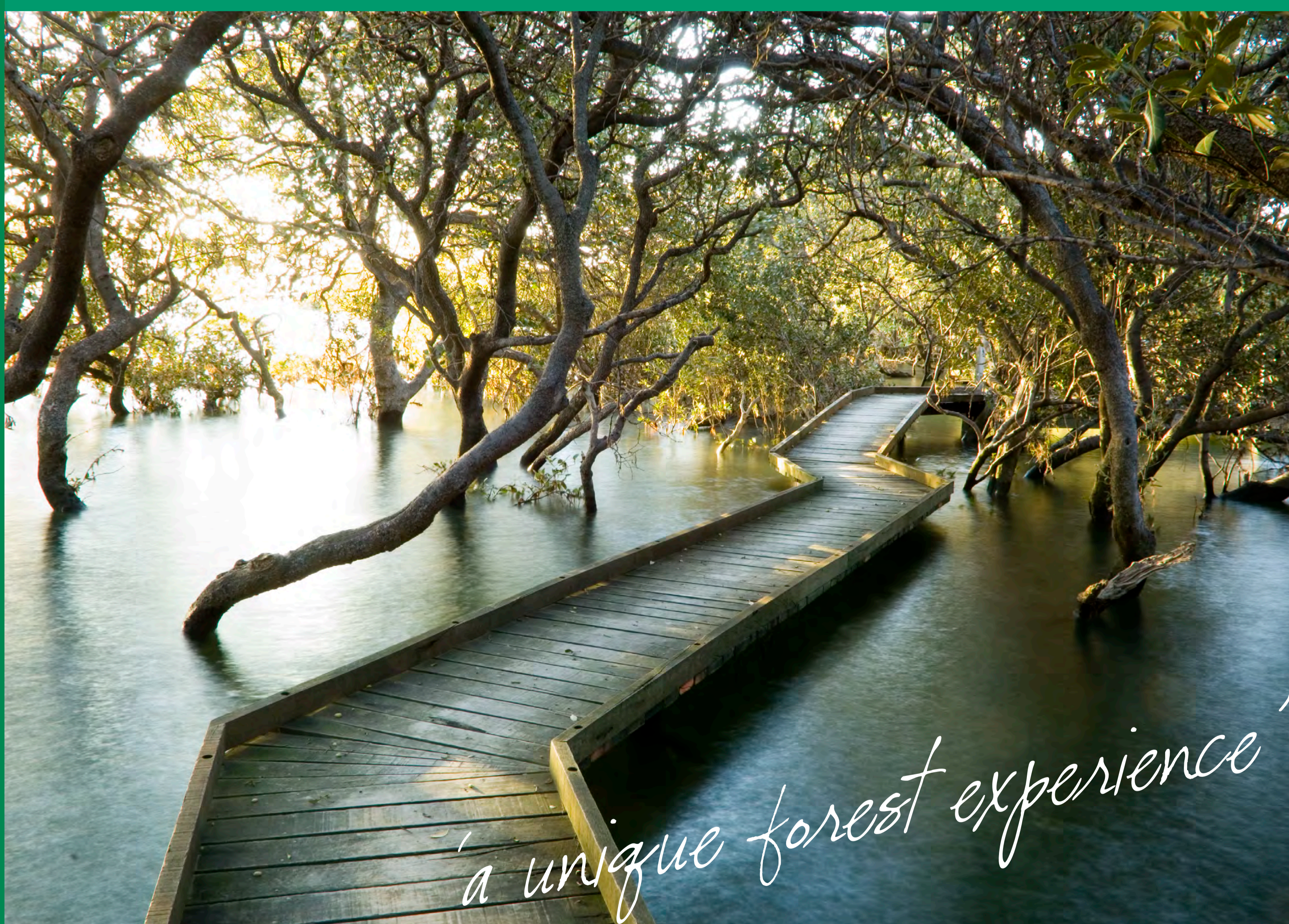
Photograph Sam Noonan