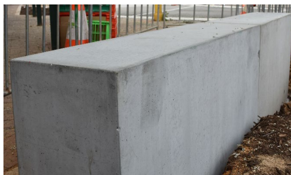
New heavily reinforced concrete beams for pedestrian safety awaiting bench installation