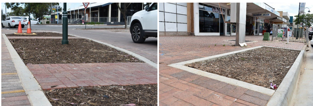
New garden beds on John Street – plantings to occur throughout November and December

Landscaping work along John Street and Church Street, including removal of end-of-life trees and the installation of new garden beds will enhance the precinct and deliver a more attractive and greener streetscape. Trees and shrubs are being planted to improve the quality of the streetscape and open up new spaces for shoppers, visitors and diners.