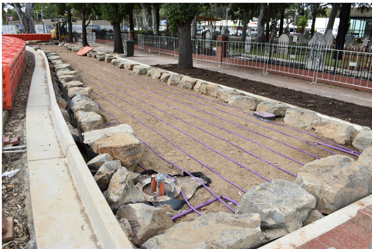
Landscaping and drainage treatments on Church Street