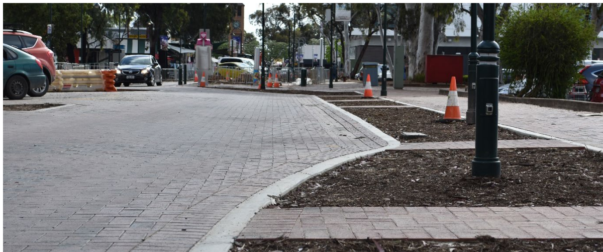
New garden beds awaiting plantings along John Street (adjacent Parabanks Shopping Centre)

Demolition works to remove the kiosk and tower signage adjacent to the Stockade Tavern is complete. This area is being transformed into a landscaped pathway to improve pedestrian access and experience.