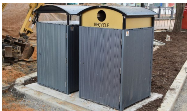
New bins on John Street

Landscaping works along John Street and Church Street are being complemented with new pedestrian connections and accessibility improvements including new kerbing, footpaths, ramps and disability permit parking. Public art installations will be undertaken in late December. New street furniture including benches and other amenities such as new bins and drinking fountains are also being installed throughout December, improving public facilities in the area and providing a modern, consistent and vibrant new look.