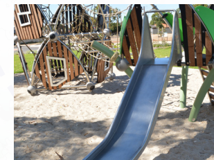
Play tower with slide