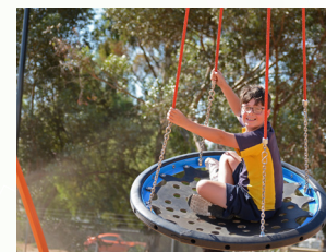
Swings set and Basket swing