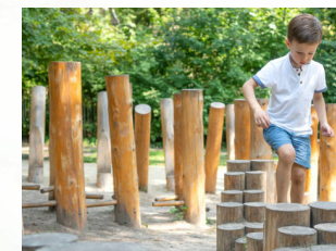
Totem pole climb