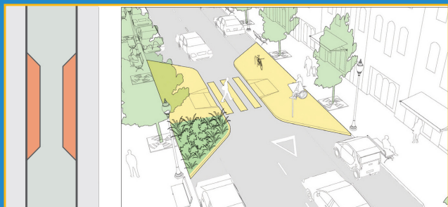
Proposed narrowed footpath crossing locations

The Streetscape Renewal Program aims to deliver enhancements to selected streets in the City of Salisbury that will enrich and beautify the City.