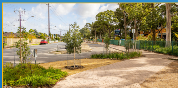
Street trees and rubble verge treatment