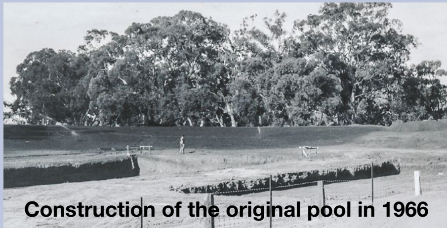
Construction of the original pool in 1966

The Salisbury Swimming Pool was constructed in 1966 and this site represents a lifetime of memories for our community.