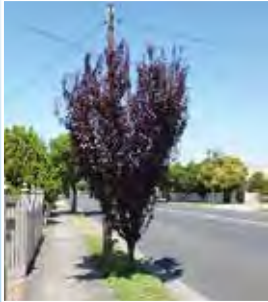
Oakville Crimson Spire Prunus cerasifera 'Oakville Crimson Spire'

A deciduous tree, up to 6m in height, with a slender canopy. It has deep reddish-bronze foliage and pink to white flowers that appear in spring. This tree is tolerant of a range of climatic conditions. It is recommended for small verges and is approved by SA Water and ETSA.